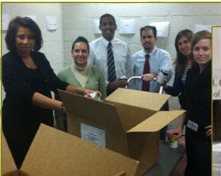
Court of Appeals Judge Anna Blackburne-Rigsby and staff