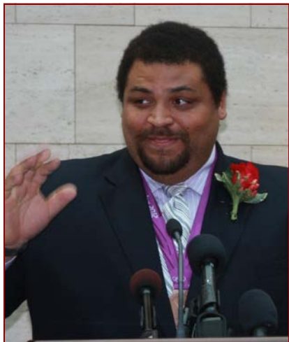
Olympic shot put bronze medalist Reese Hoffa.

For these new homes to be created incredible sacrifices had to be made. Recognizing these sacrifices, Reese congratulated all the new families being created in a special way. Speaking to the adoptive parents he said: "you're going to be adopting some incredible kids today."