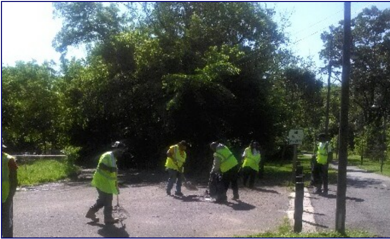
Clean-Up Day in action.