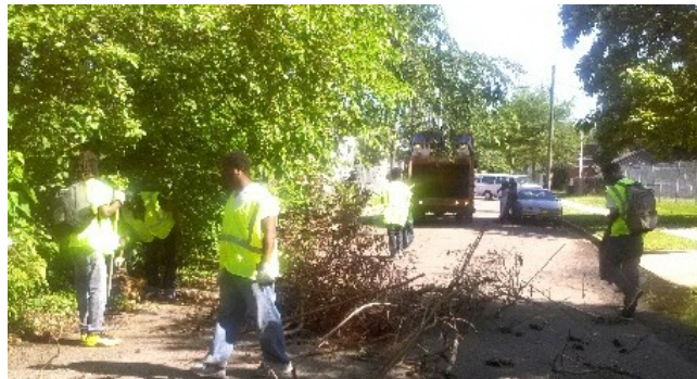
Community Service Clean-Up Day

The Community Service Program (CSP) in the DC Superior Court's Criminal Division, in conjunction with the DC Department of Public Works (DPW), Special Operations Division coordinated two successful Community Service Clean-Up Days on May 31 and July 5, 2014. The Community Service Program has worked with the Department of Public Works, Special Operations Division over the last three years as a site for misdemeanor defendants to complete community service hours. Under the supervision