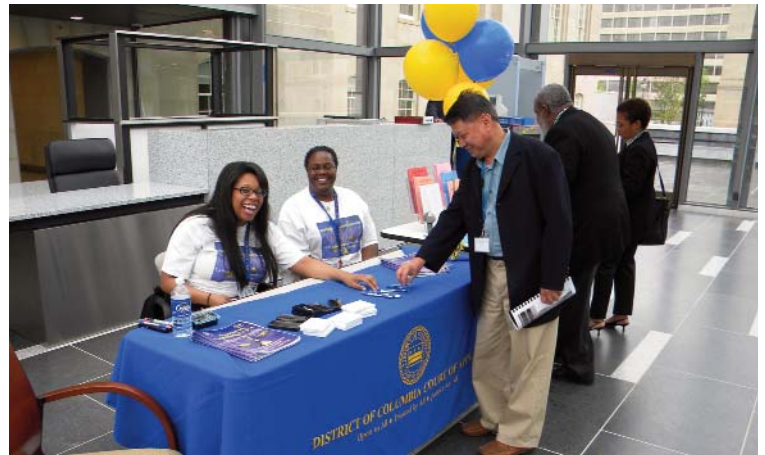
Staff offer assistance at the "Welcome" table at the newly opened Historic Courthouse.