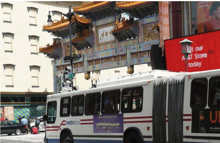
Metrobus with sign announcing the Open House.