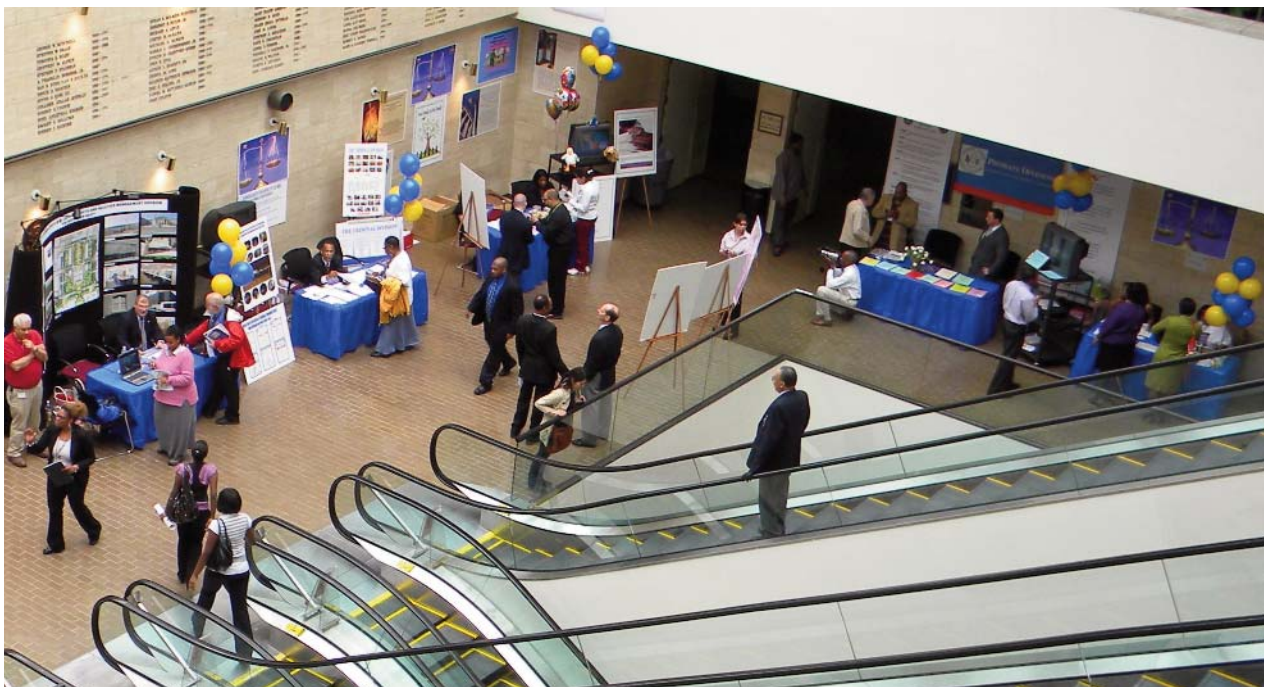
View of the Moultrie Courthouse atrium during the Open House.