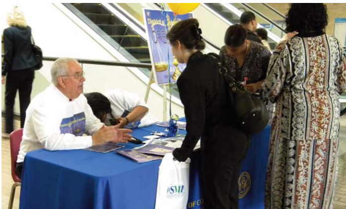
Employees hand out schedules and give directions to Open House events.