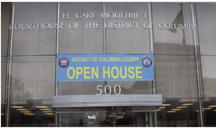
A sign on the new front entrance of the Moultrie Courthouse welcomes the public to the Open House.