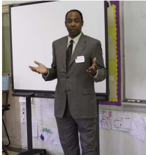
Judge Satterfield rhetorically asks students at Banneker, “Who am I talking to?”

“Self-inflicted wounds bleed, they make you weak.” These can include anything from drugs, gangs, turning to crime, or simply allowing oneself to stop reaching for one’s goals. Judge Satterfield acknowledged that the road to success is not an easy one but that leaders were up for the challenge, and then he told