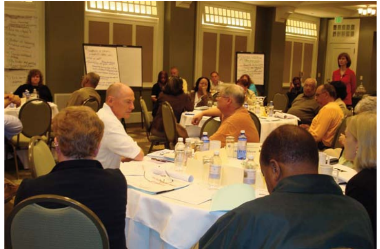
Senior managers building a better workplace.

The judges then heard from a number of speakers who discussed such specialized and highly technical information as PET scans, neuroscience, the admission of expert evidence, creative aging, and the teenaged addicted brain. The senior managers discussed how to make the D.C. Courts a better place to work at all levels and — as you can imagine — were only able to scratch the surface of this very interesting and complex subject. One thing