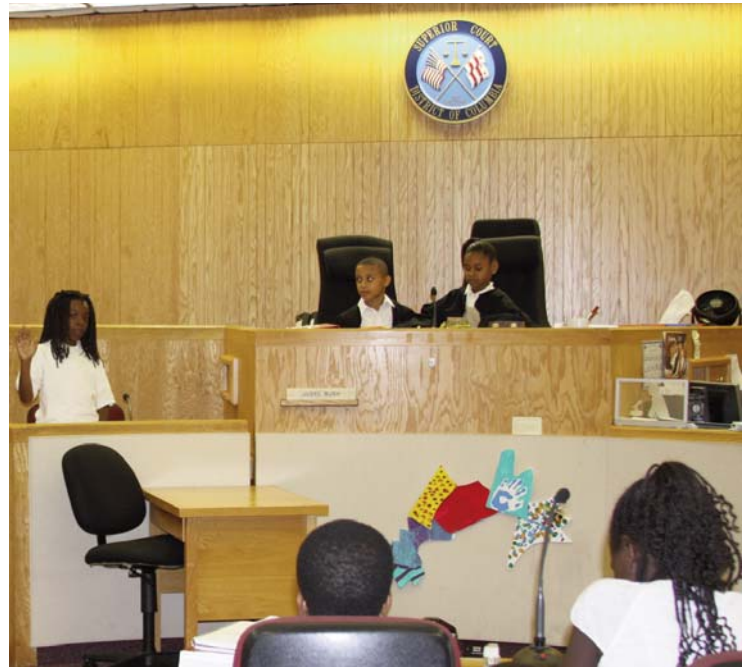
Youth Law Fair participants in a mock trial.

judicial and lawyer volunteers. The teens got a lot out of it because of all the work that everyone put into it.