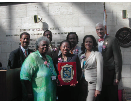
Defender Services Branch received the Public Service Award (Office)

Heartfelt congratulations to all the 2006 Awardees!