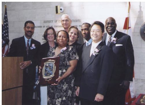
Center for Education and Training received the Enterprise Service Award