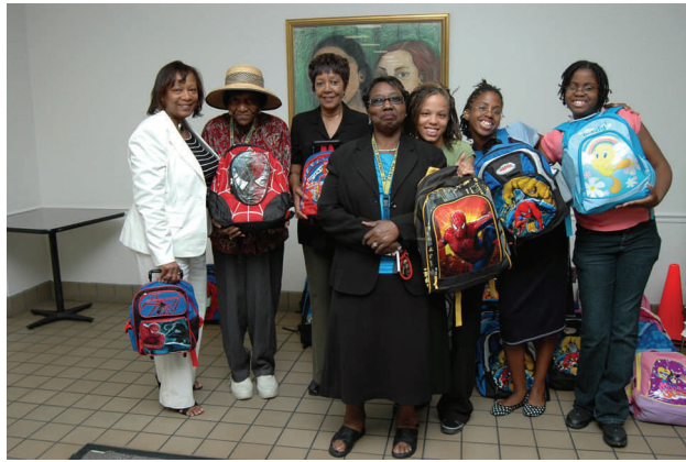
Child Care Center staff and volunteers from the DC Summer Youth Program show the backpacks.