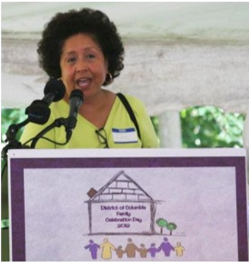
The Honorable Zoe Bush, Presiding Family Court judge

Complemented by activities for children, such as face painting and a moon bounce, various organizations exhibited their services and hosted training sessions to provide ample resources for celebrating families. One of the exhibits by the DC Central Kitchen included a food demonstration on healthy eating with samples and recipes. Also, a pair of freelance photographers provided free family portraits for the reunified families.