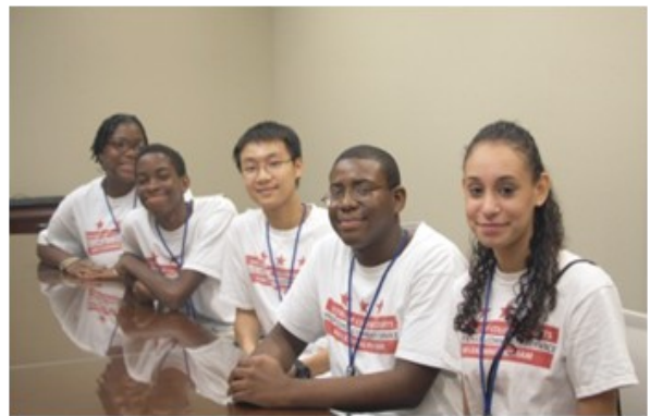
2012 CSL interns

The implementation of the CSL Program was a rewarding achievement and the program is expected to continue next summer. CSL provides an invaluable opportunity for high school students to learn and develop through active participation in service that meets the needs of the community while learning about the judicial system.